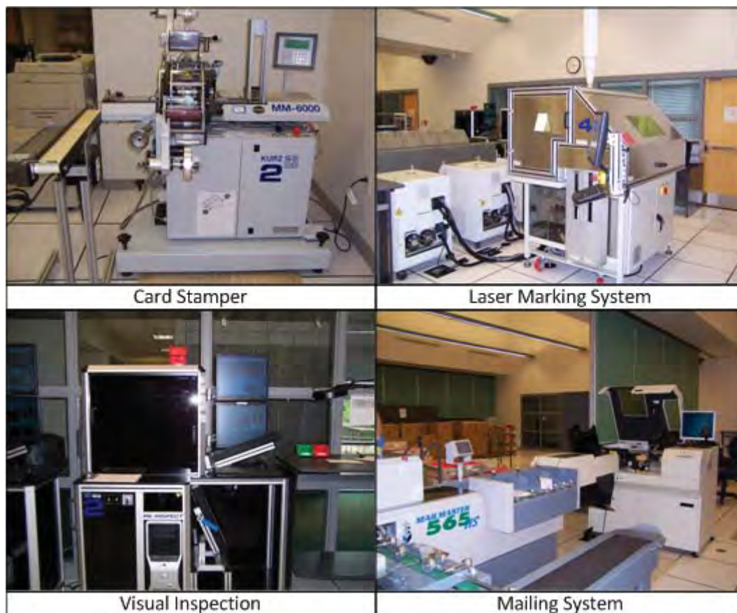
Figure 3. ICPS Equipment at the Corbin Production Facility

USCIS produces permanent resident cards at its Corbin Production Facility in Corbin, KY. Figure 3 depicts ICPS production equipment at the facility. We evaluated security controls implemented to secure the workstations that operate this equipment.